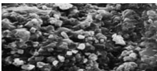
Figure 2: Close-up of the micro-crystalline particle surface of Omya Neutrasorb

In comparison to burnt lime, Omya Neutrasorb does not form scales. Clogging of pipes can be ruled out and sophisticated circle line concepts, valve designs and make-down stations are not necessary. This significantly reduces maintenance costs and man-hours and increases station availability.