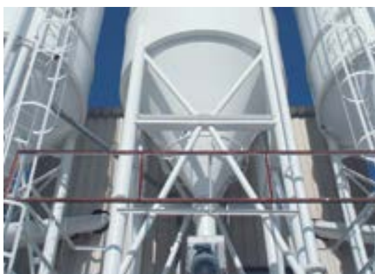
Figure 1: Scale formation is a common problem of lime slakers. Omya Neutrasorb does not form scales and reduces maintenance costs

“Omya Neutrasorb is finely ground and particles have a highly reactive micro-crystalline surface.”